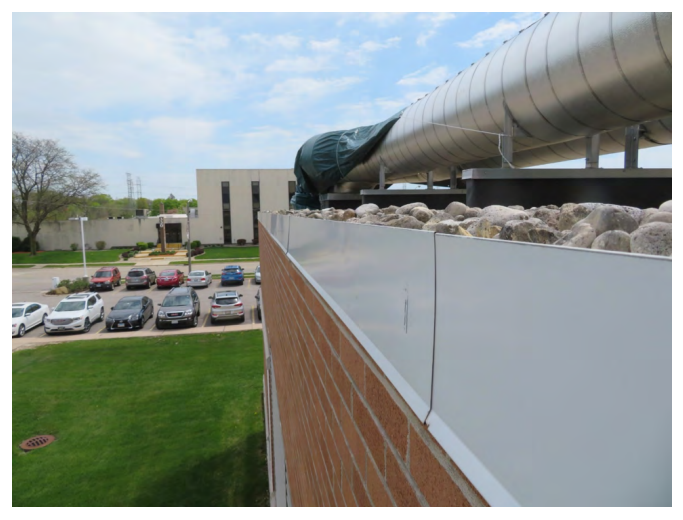
Photo 1: Edge metal must be higher than ballast (2-inch minimum).

Whether living under, providing general maintenance to existing systems, or designing or installing completely new ballasted roof assemblies, professional designers, code officials, building owners, and roofing contractors are encouraged to consider the basics provided above. 菾