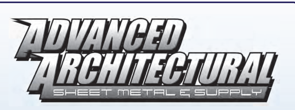
Serving Contractors & Supply Houses for Over Two Decades.

Refueling of diesel tanks shall be performed when the rubberized asphalt melter is off. A refueling and spill prevention plan approved by the fire code official shall be utilized. Refueling shall