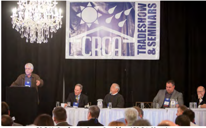
CRCA's Roofing Industry Breakfast